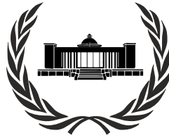
GUJARAT LEGISLATIVE ASSEMBLY