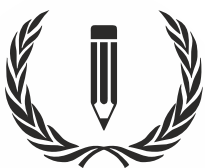
OPEN DESIGN DIMENSION

ODD (Open Design Dimensions) is for young creators who see the world differently, those who notice the ODD in the ordinary and dare to rise above the average. ODD – For the ones who see the world differently. Designed for design-driven students and amateurs, the competition opens doors to AI Graphic Narratives, Photography, Short Films and Poster Design. It celebrates imagination, originality and bold creative exploration. ODD encourages participants to break norms, craft unique narratives and express ideas using emerging tools. It offers real exposure to modern design processes and the evolving digital landscape, empowering young creators to sharpen their voice, expand their boundaries and shape their future with confident, innovative design thinking.